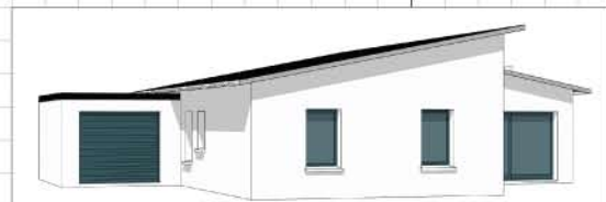
VARIANTE TOITURE BAC ACIER