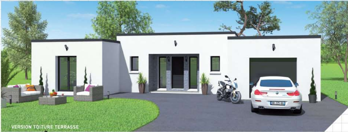
VERSION TOITURE TERRASSE